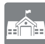
Schools & Colleges